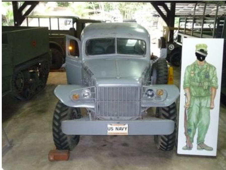
1940 GMC Truck