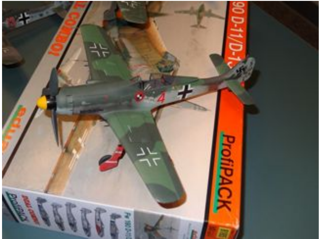
Rick's Eduard 1/48 Fw-190D Dual Combo