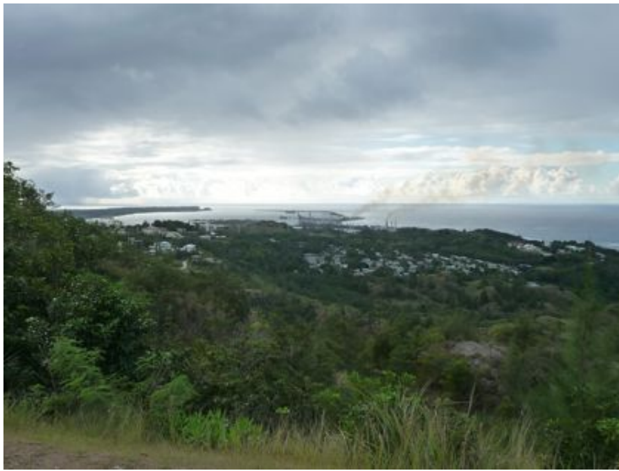
Apra harbor. Orote Peninsula is to the left.

Near the base of Nimitz Hill is the Piti Guns Site. A short hike up the hill reveals 3 140 mm Vickers artillery guns. This site has a clear shot to Agan Bay. Fortunately for US forces, the Japanese were not able to complete the installation of these guns prior to the invasion. Forced Chamorro labor was used to haul the guns up the hillside.