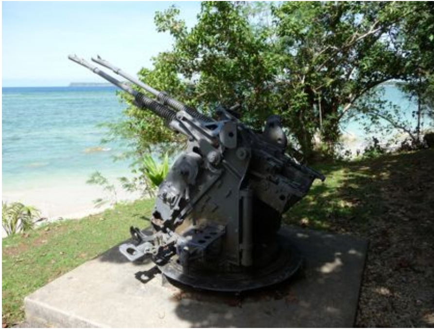
25mm AA gun at Ga'an Site