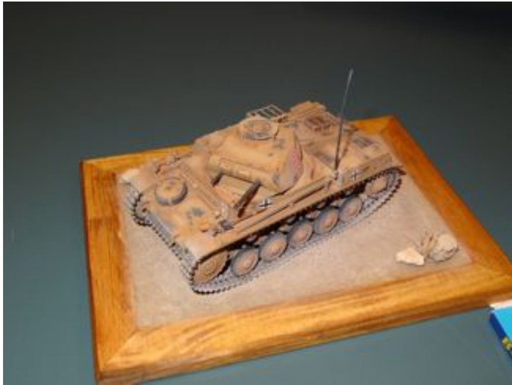
Luis' 1/35 PzII