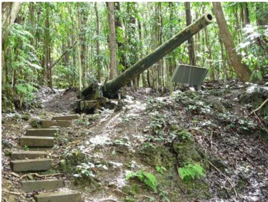
Piti Guns. 140mm Vickers gun

Near the base of Nimitz Hill is the Piti Guns Site. A short hike up the hill reveals 3 140 mm Vickers artillery guns. This site has a clear shot to Agan Bay. Fortunately for US forces, the Japanese were not able to complete the installation of these guns prior to the invasion. Forced Chamorro labor was used to haul the guns up the hillside.