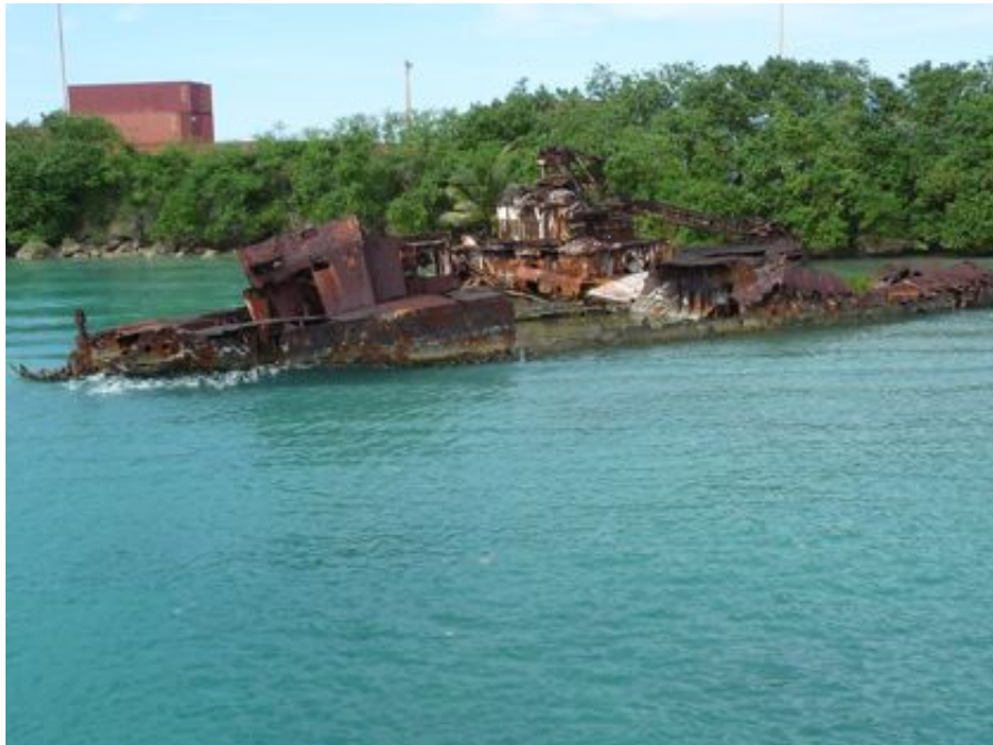
Japanese barge wreckage in Apra harbor