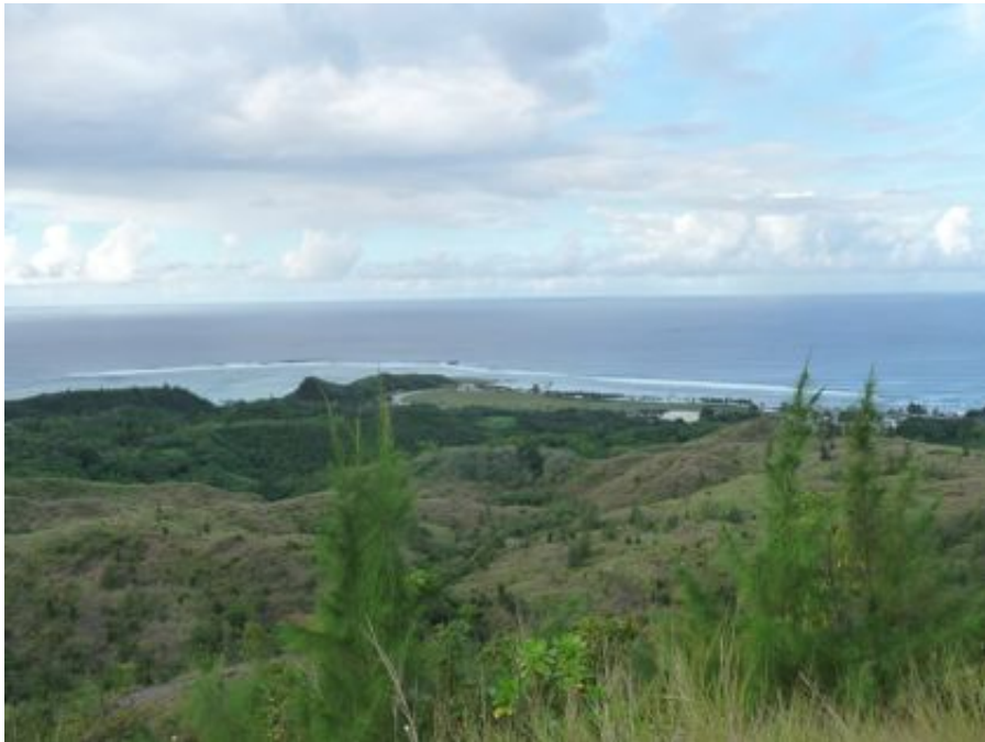
Agan Bay landing site (center of photo)

A few miles north, at the top of Nimitz Hill in the village of Piti is the Asan Bay Overlook. This site provides a panoramic view of some of the important sites, such as the Agan Bay Site ( part of the park and site of the 3 rd Marine Division landing) and Apra harbor and Orote Peninsula. There is a beautiful bronze plaque depicting the Marine landing and a large curved wall with 36 bronze plaques with the names of the US service men killed in the liberation of Guam and of native Chamorros that suffered during the Japanese occupation, in detention and forced labor camps and killed by the Japanese.