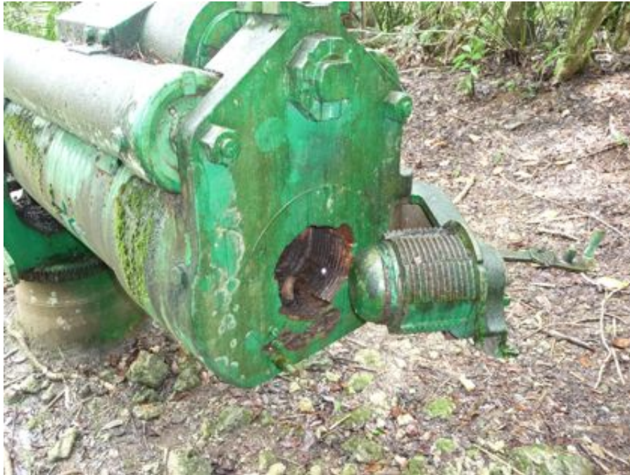
Breech of Vickers gun

Around the loop road, on the opposite side of Nimitz Hill from the Piti Guns is the Pacific War Museum.