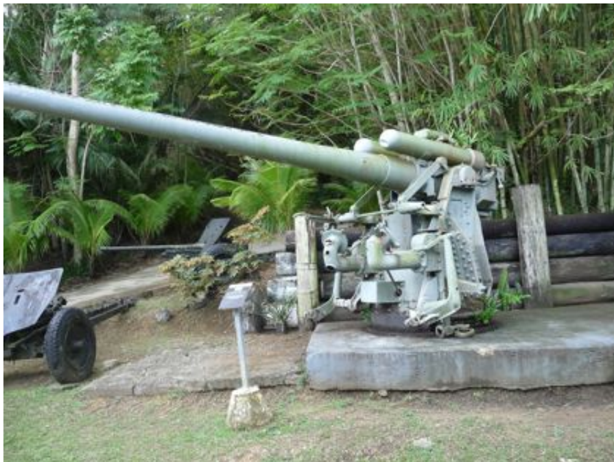
Japanese Naval gun

Across the street from the Museum, in the parking lot of an equipment supply business is a rusting Japanese light tank. It incongruously shares space with several fiberglass dinosaurs!