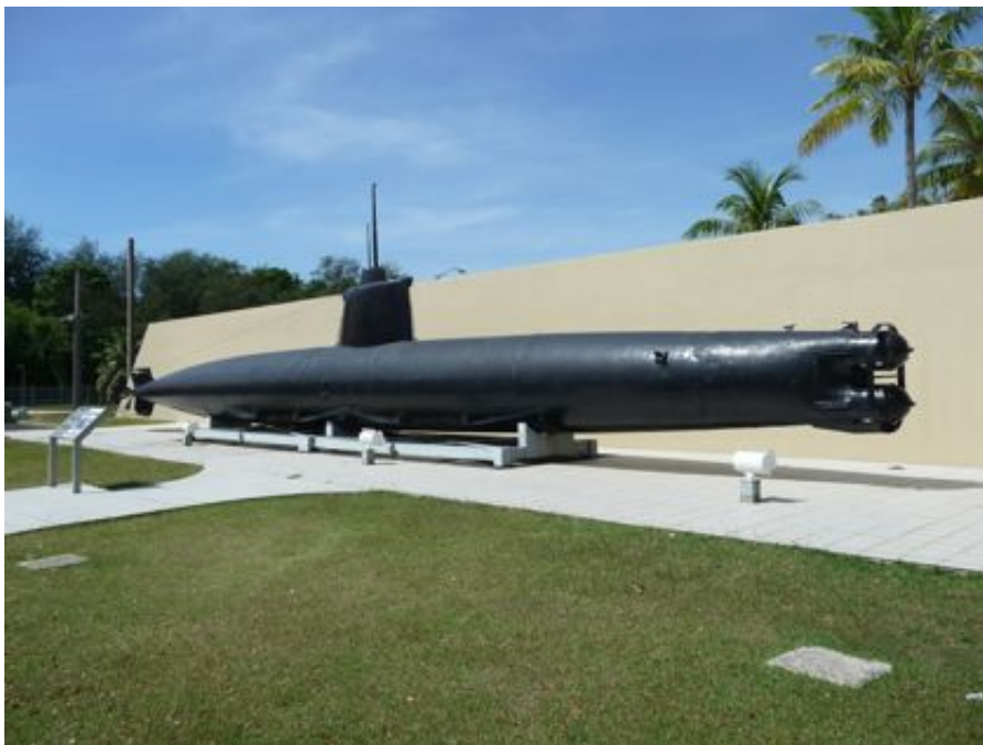
Japanese Ko-hyoteki –class, Type A 2-man midget submarine

The US National Parks Service operates the War in the Pacific National Historical Park on Guam. The park is composed of several important sites throughout the island. The primary visitor center and museum is located just outside the main gate of the Naval Base Guam on the Orote Peninsula. The small museum has numerous displays, some interactive, giving the history of military operations on Guam, the War in the Pacific and the aftermath of the war. Many of the displays focus on the impact to the people of Guam. The museum has an excellent gift shop with many books and videos on Pacific War subjects. On display in front of the museum is a Japanese two-man mini submarine, which ran aground in Apra harbor just a few days after the end of the battle on August 10. This sub was on display for many years on the Navy base, but was recently moved to the visitor center.