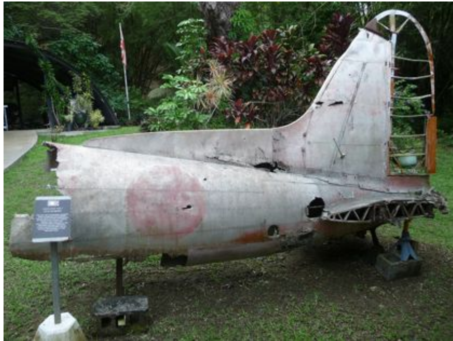
Aichi D3A "Val" tail section