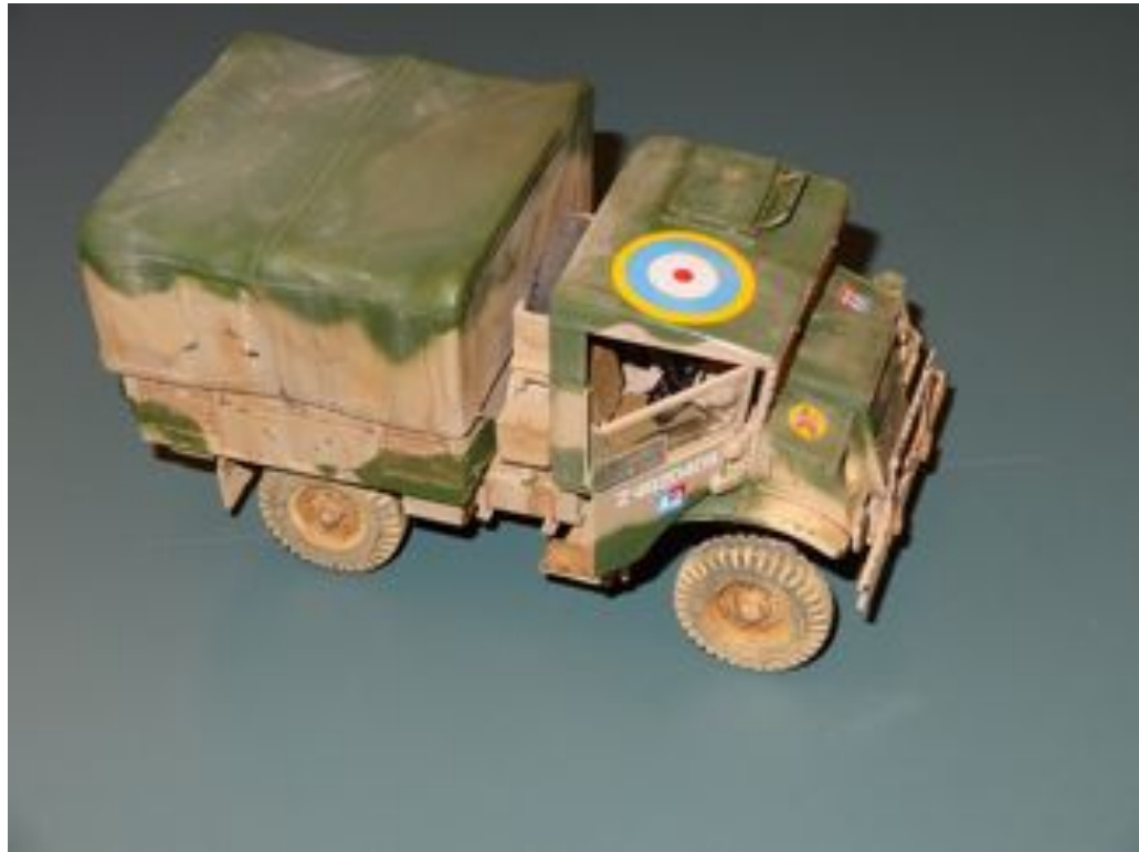
Mike O.'s 1/35 15cwt Chevy Truck