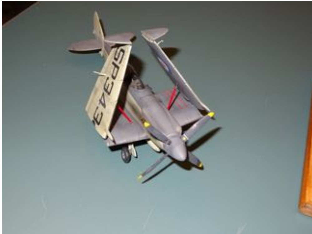
Luis' 1/48 Airfix Seafire XVII

I don't have the usual detailed write-ups this month, but here's what the members brought to show in January.