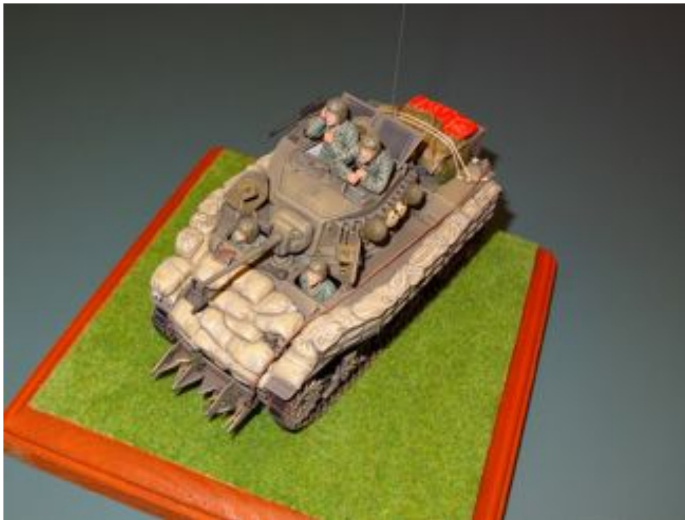
Tom's 1/35 Stuart