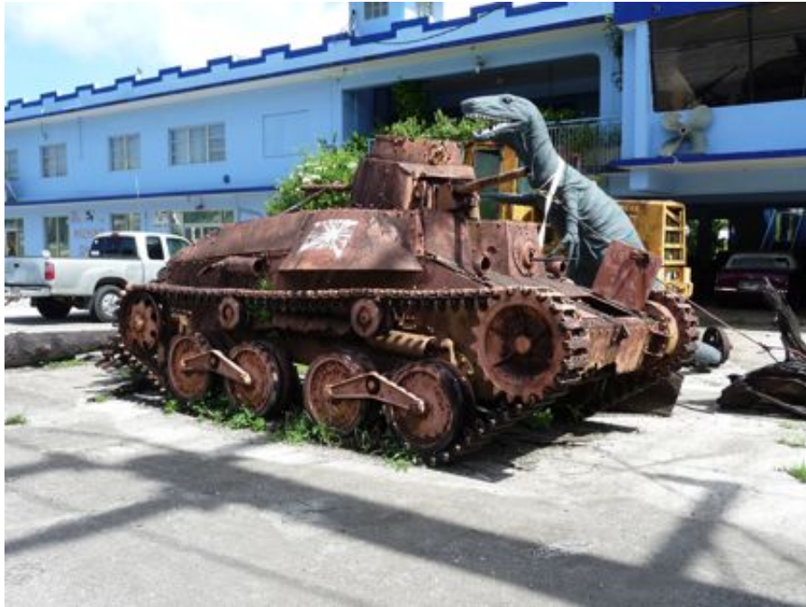
Type 95 Ha-Go Light Tank

On the southeast side of the island, near Talofofu Falls is Sargent Yokoi's cave. Unfortunately, this is a replica, as the actual cave collapsed in the 1980's