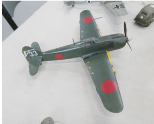
1/48 th Hasegawa Ki-100