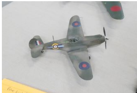
1/72 Academy P-40

The 1/48 th AGE was from a number of sources, mostly Tamiya and Skunk Model.