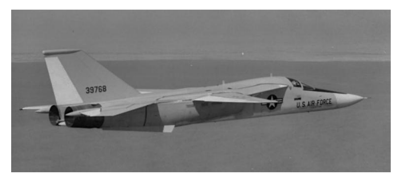
TFX winner was the F-111, shown here YF-111

In the 1960s, both the <u>U.S. Air Force</u> and <u>U.S. Navy</u> were in the process of acquiring large, heavy fighters designed primarily to fight with missiles. <u>Project Forecast</u>, a 1963 Air Force attempt to identify future weapons trends, stated that a counter air force must be able to destroy aircraft in the air at long ranges using advanced weapon systems. The Air Force felt that these needs would be filled for the next twenty years by missile-armed variants of the <u>F-111</u> and <u>F-4</u> <u>Phantom II</u>. Their F-X fighter acquisition program, initially merged into the TFX program (which developed the F-111), was written along those lines.