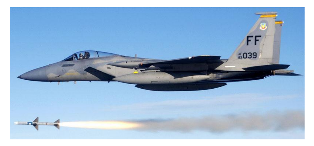
McDonnell Douglas F-15

an aircraft that was far superior in maneuverability to the F-111 fighter variants. The Air Force had also been studying a lighter <u>day fighter</u>; starting in 1965, the Air Force had pursued a lowpriority study of the Advanced Day Fighter (ADF), a 25,000 pound design. After they learned of the <u>MiG-25</u> in 1967, a minor panic broke out and the ADF was dropped in order to focus work on the F-15. The F-15, originally a lighter aircraft, grew in size and weight as it attempted to match the inflated performance estimates of the MiG-25. While Boyd's contributions to the F-15 were significant, he felt that it was still a compromise.