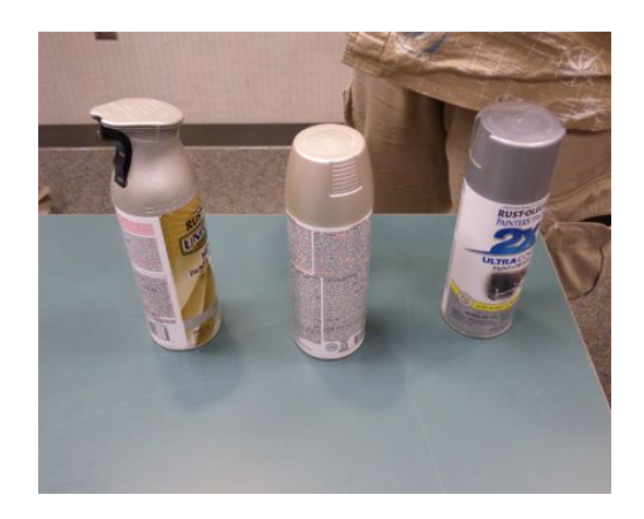
Bill P. brought in various metallic Krylon paints. These can be useful for depicting some metallic finishes different from the usual hobby paints, and you certainly get a lot of paint for your money. Available at your favorite home improvement outlet.

The Moletow Liquid Chrome marker pen. This pen dispenses a very bright chrome enamel. Probably the most obvious use is chrome trim on model cars. Mike says it's much easier than the car modeler's usual go-to, Bare Metal Foil. I can see this also being useful for doing aircraft landing gear oleos or hydro cylinders on armor. The pen is available in 3 tip sizes, 1, 2 and 3mm. Available from several sources, such as Sprue Brothers and Burbank House of Hobbies.