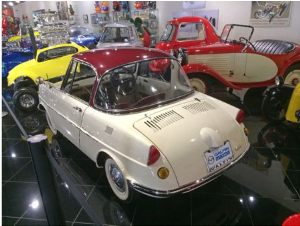
1963 Mazda 360. This thing is tiny! 360cc V-twin engine. One of the first Mazdas