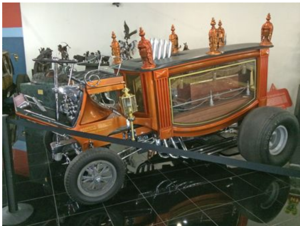
Okay, how many of you built this as a kid? The Boot Hill Express. It's recently been re-released by Revell/Monogram