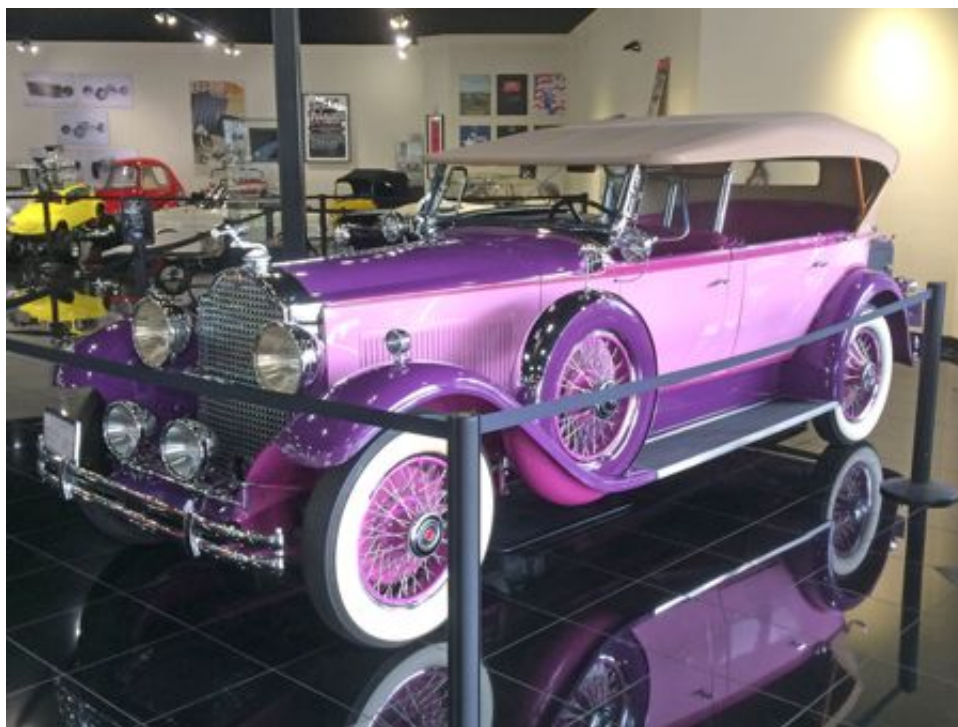
1928 Lincoln. Wild colors! AMT kitted the '28 Lincoln in the “Gangbusters” series