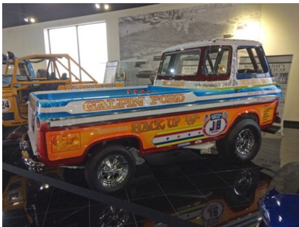
The “Backup Pickup”. 1964 Econoline pickup wheelstander. The novelty of this truck is that it goes down the track backwards! The bed is the front and the cab is the back!