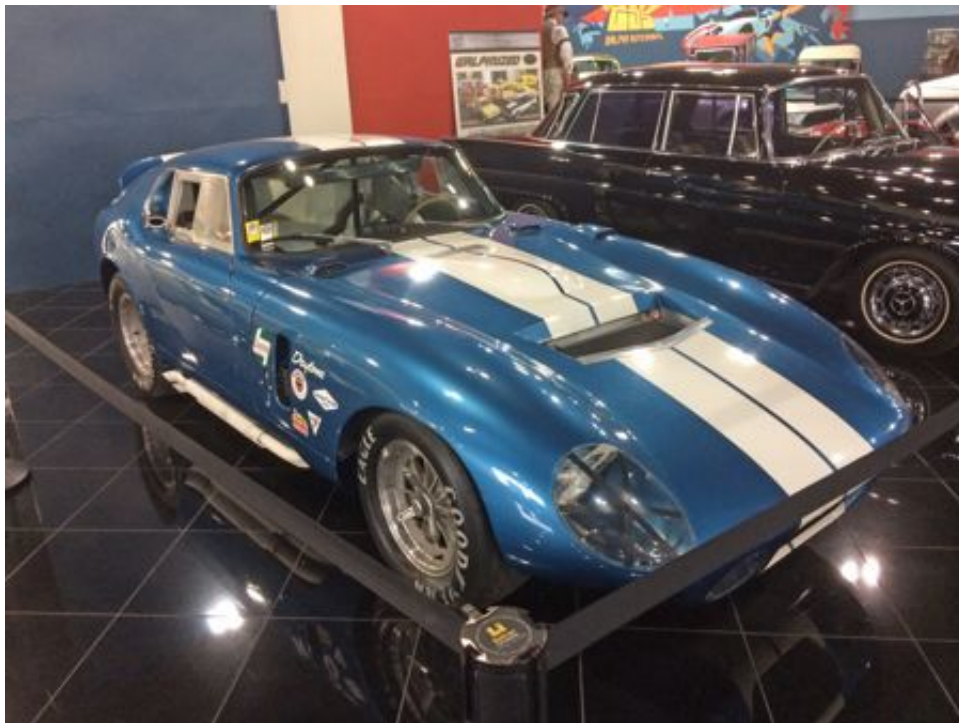
Cobra Daytona Coupe. Designed by Pete Brock as an endurance racing version of the Cobra. This is the real deal, not a replica. The Daytona was available from Gunze Sangyo as a multi-media kit.