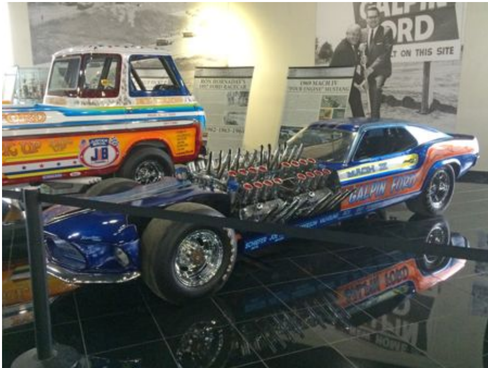
Mustang “Mach IV”. Four engines, four wheel drive, ‘nuf said!