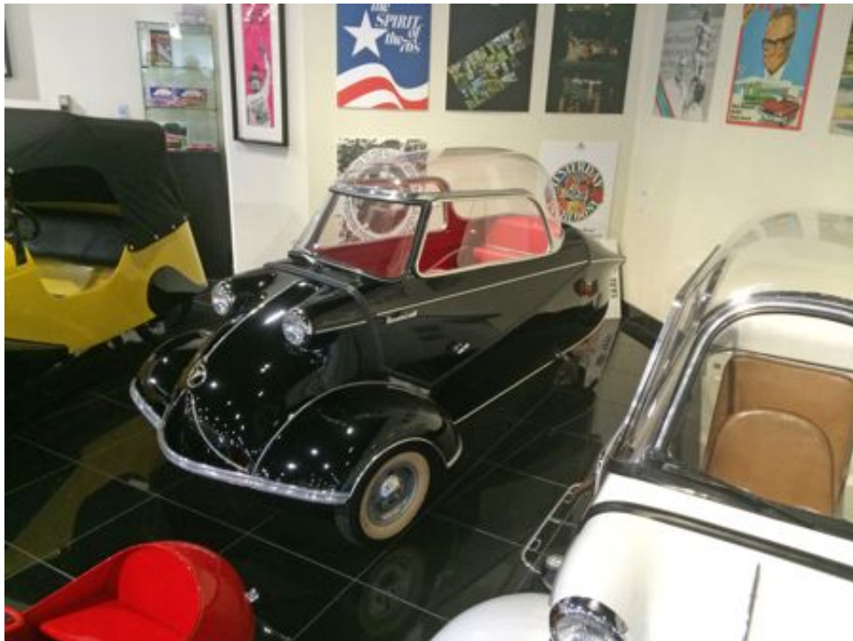
1952 Messerschmitt KR200. Yes, THAT Messerschmitt. 200cc two-stroke motor and three wheels. Gunze kitted this, too.