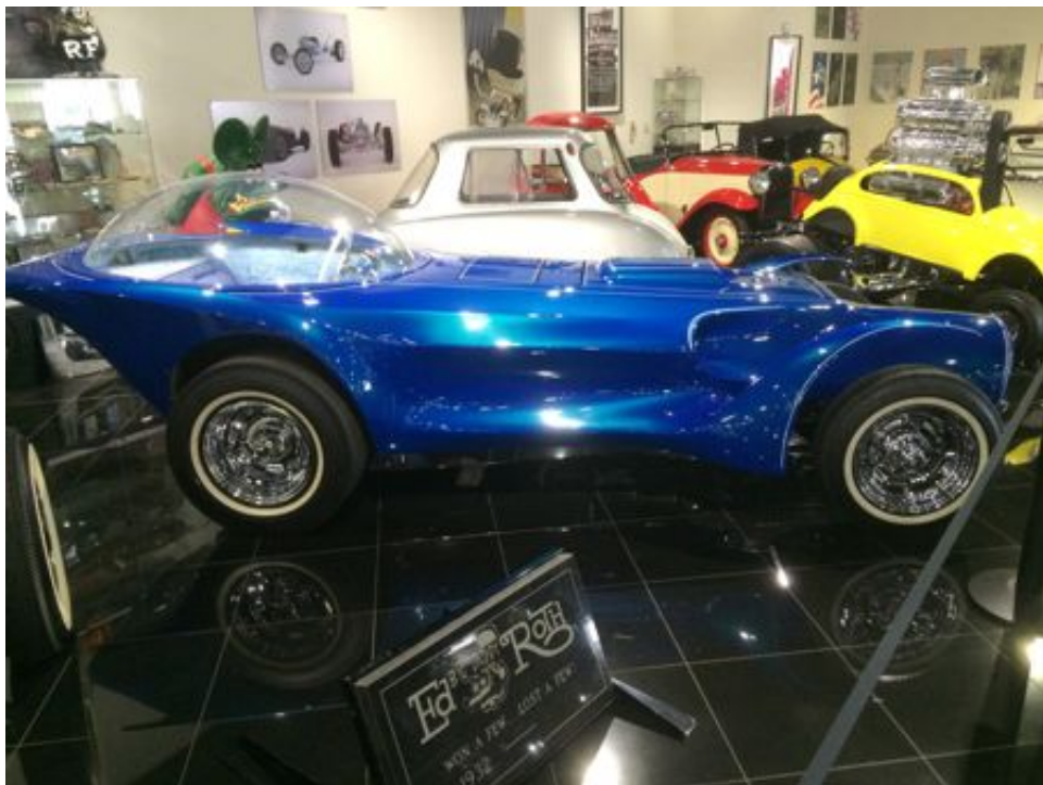
Ed Roth "Orbitron". This was found derelict and GAS recently completed a full restoration.