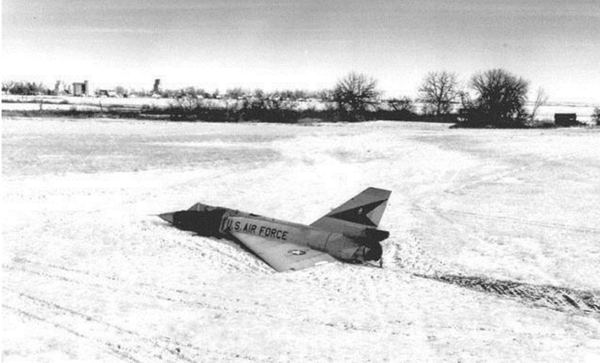
The six softly bellied in and slide over a quarter of a mile to a stop where it sat with the engine still running.