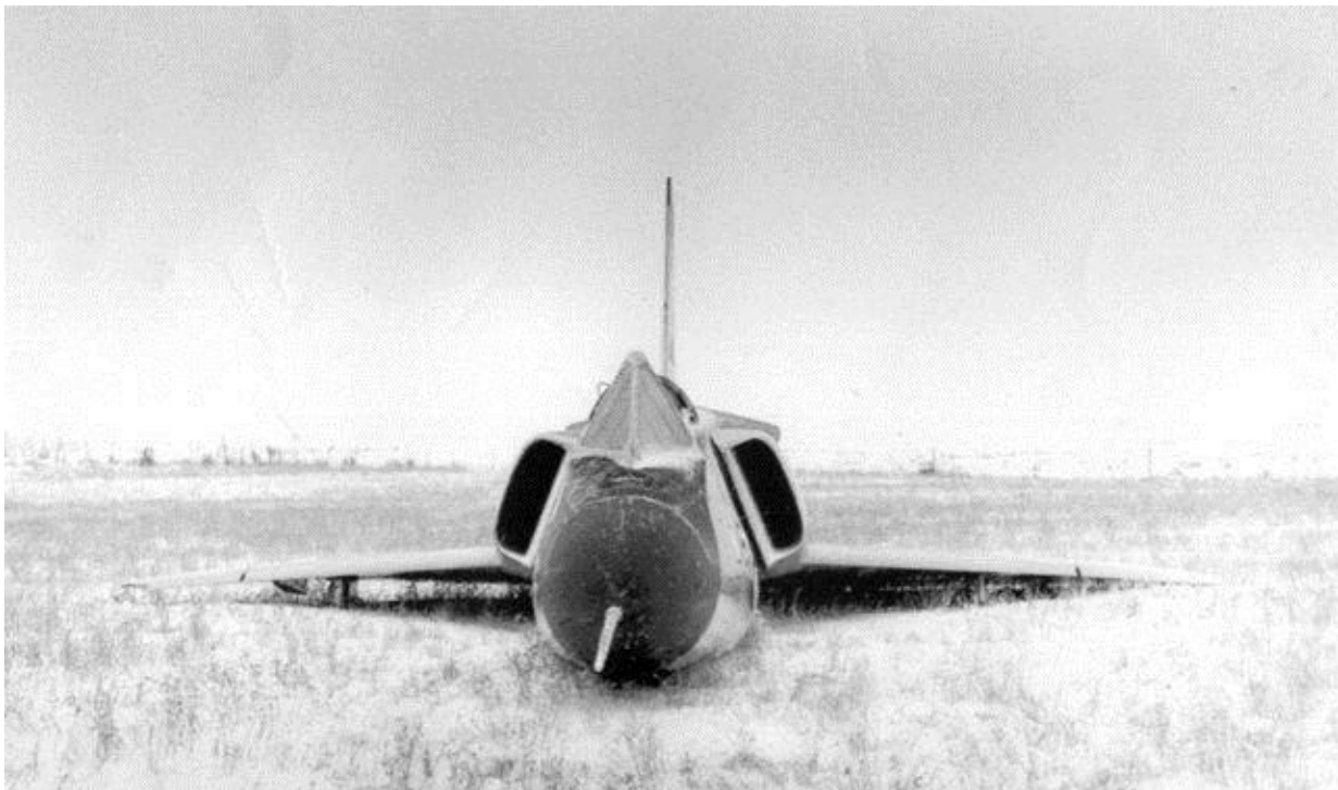
Front view of F-106 58-0787 after its pilotless countryside ride.