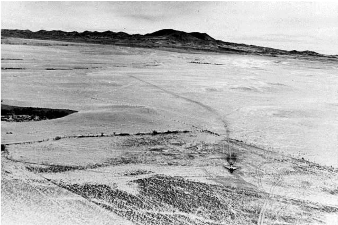
Skid path of F-106 58-0787 that bellied in on its own after pilot ejects.