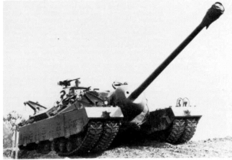
T28 Super Heavy Tank

The answer for December's trivia was the T28 Super Heavy Tank, also known as the 105mm Gun Motor Carriage T95. The T28 was a self-propelled gun system developed by the US Army in World War II as an answer to the German Super Heavy Tanks, like the Maus and E100 and to break through the Siegfried Line. The T28 never left the prototype stage. The first vehicle was not completed until after the war had ended and the program was cancelled two years later.