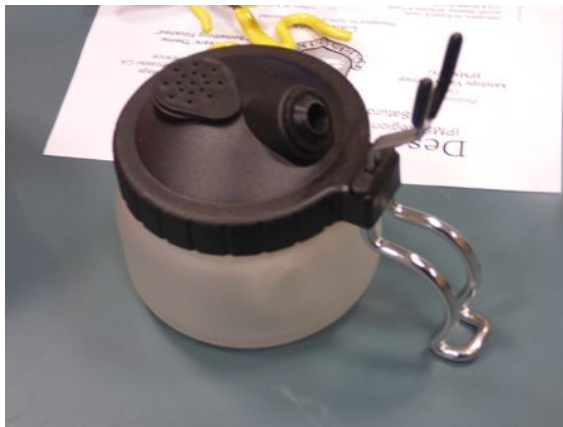
Airbrush cleaning station. Spray the airbrush into the container, traps all the fluid and fumes. Available from Micro Mark or eBay, $20-ish.