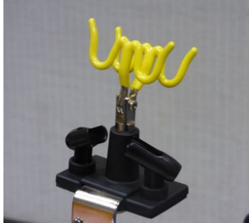
Airbrush holder. Holds 4 airbrushes. From Micro Mark, $20.

“Rich the Tool Man” brought in some more cool stuff: