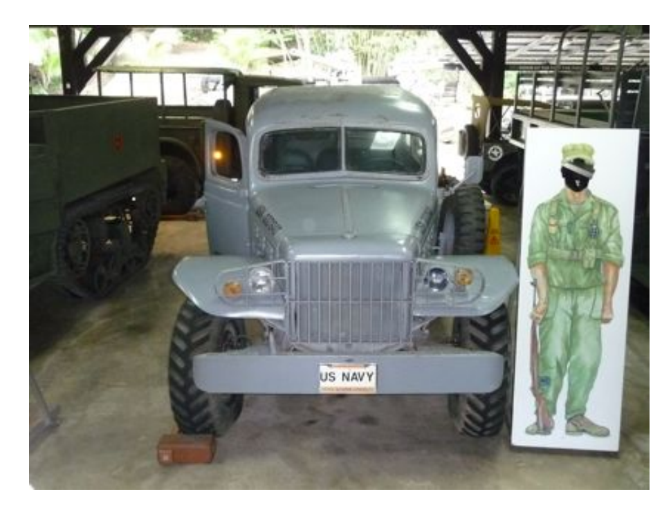
1940 GMC Truck