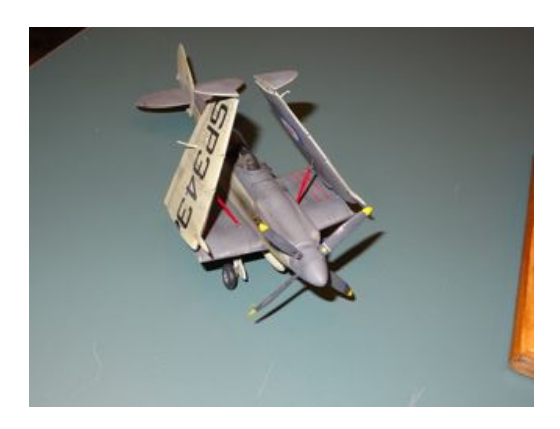
Luis' 1/48 Airfix Seafire XVII

I don't have the usual detailed write-ups this month, but here's what the members brought to show in January.