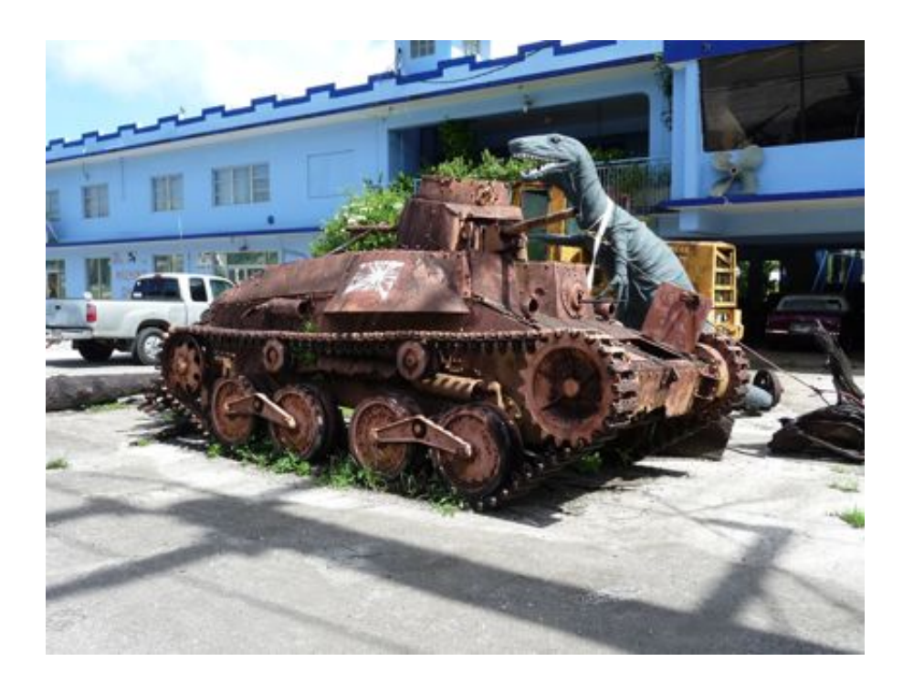
Type 95 Ha-Go Light Tank

On the southeast side of the island, near Talofofo Falls is Sargent Yokoi's cave. Unfortunate, this is a replica, as the actual cave collapsed in the 1980's