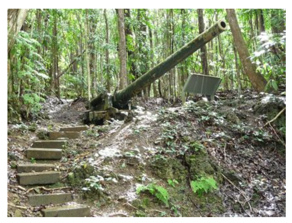
Piti Guns. 140mm Vickers gun

Near the base of Nimitz Hill is the Piti Guns Site. A short hike up the hill reveals 3 140 mm Vickers artillery guns. This site has a clear shot to Agan Bay. Fortunately for US forces, the Japanese were not able to complete the installation of these guns prior to the invasion. Forced Chamorro labor was used to haul the guns up the hillside.