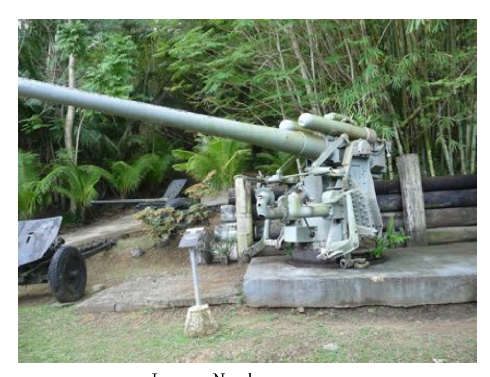
Japanese Naval gun

Across the street from the Museum, in the parking lot of an equipment supply business is a rusting Japanese light tank. It incongruously shares space with several fiberglass dinosaurs!