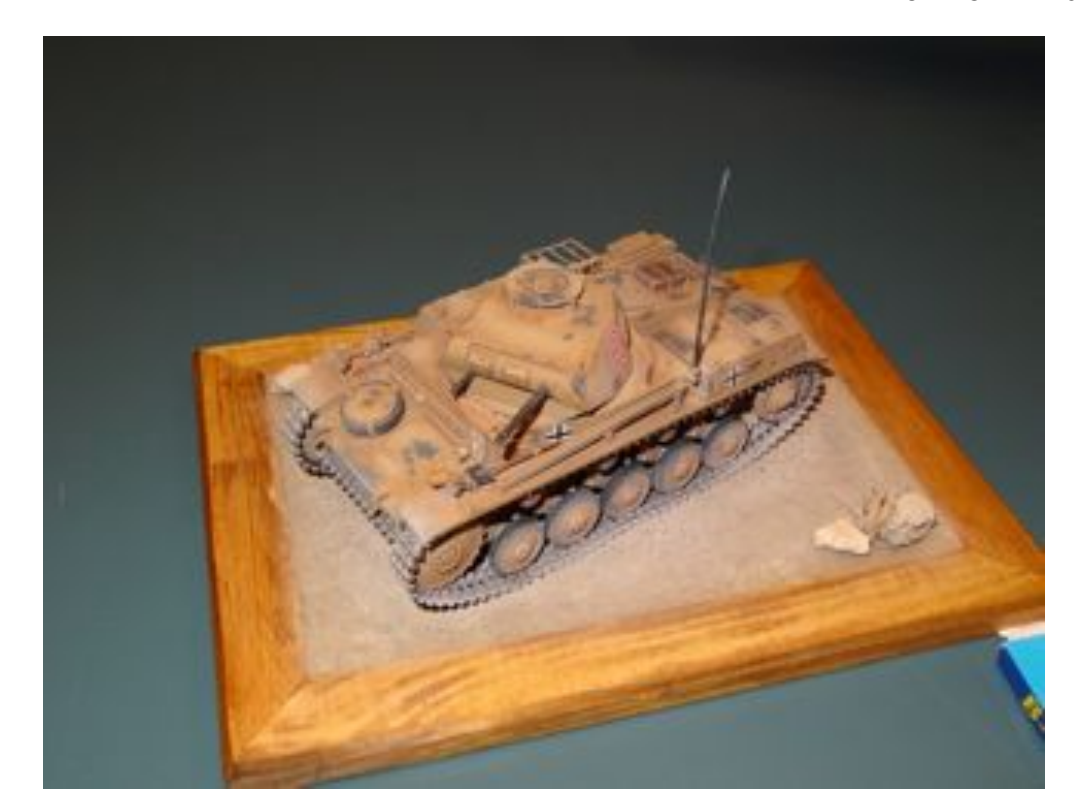
Luis' 1/35 PzII