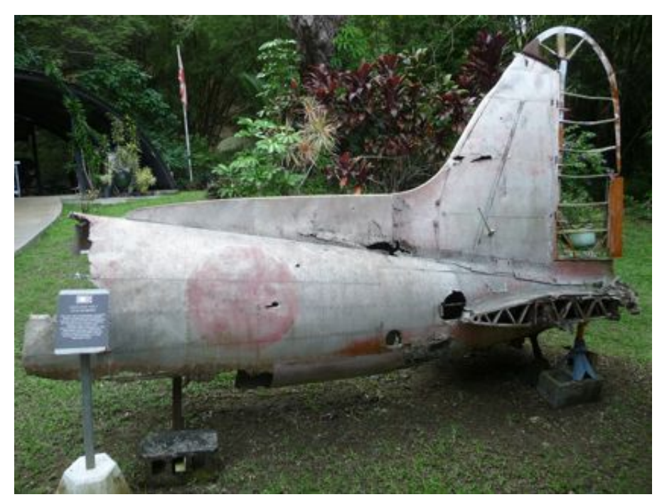
Aichi D3A "Val" tail section