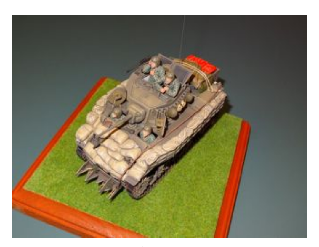
Tom's 1/35 Stuart