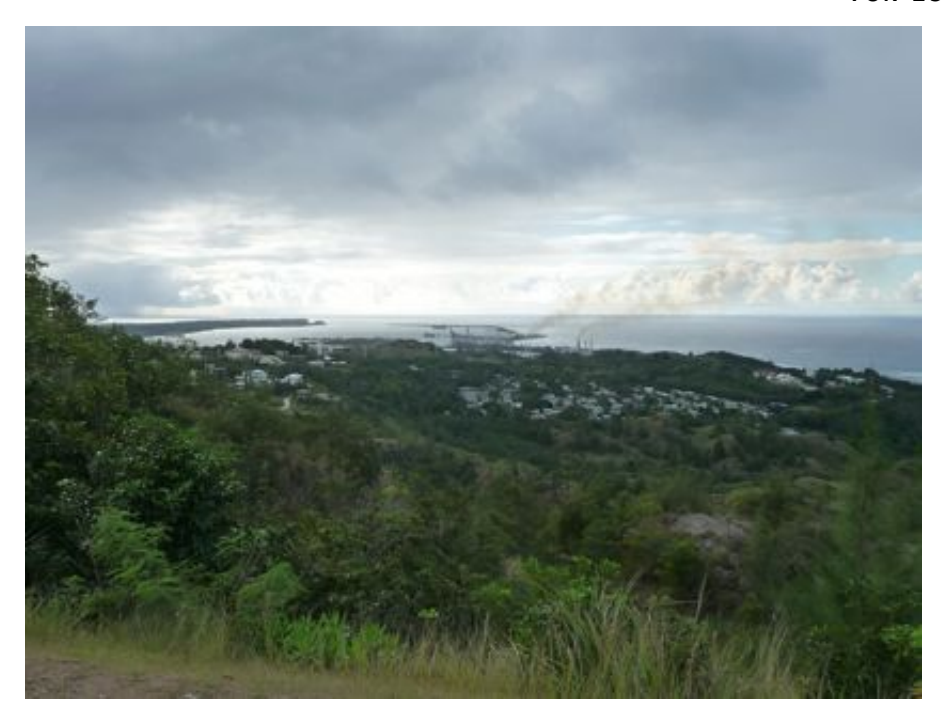
Apra harbor. Orote Peninsula is to the left.

Near the base of Nimitz Hill is the Piti Guns Site. A short hike up the hill reveals 3 140 mm Vickers artillery guns. This site has a clear shot to Agan Bay. Fortunately for US forces, the Japanese were not able to complete the installation of these guns prior to the invasion. Forced Chamorro labor was used to haul the guns up the hillside.