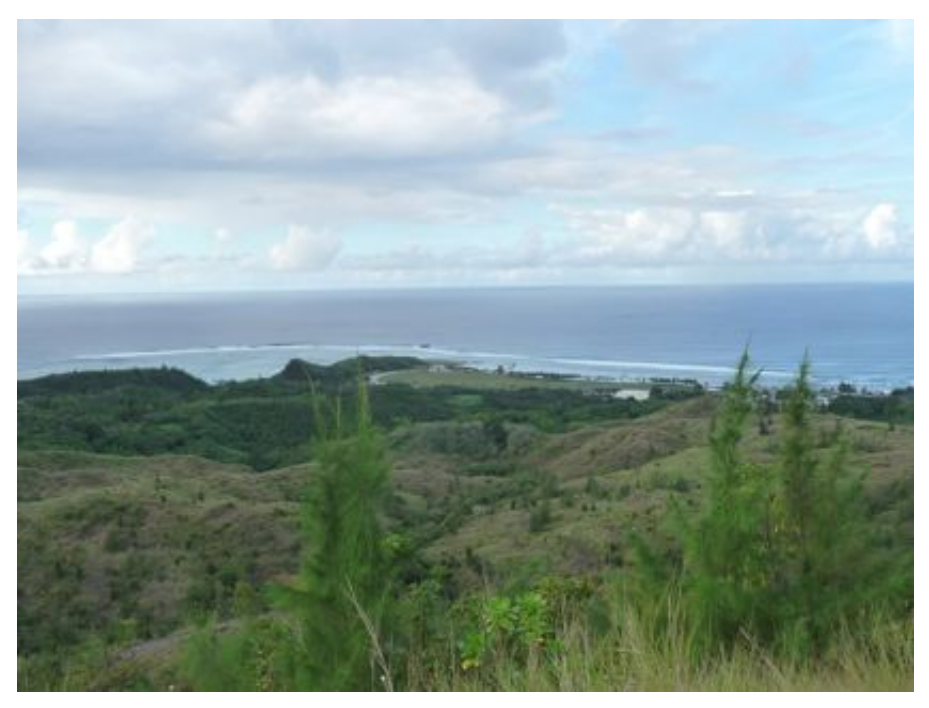
Agan Bay landing site (center of photo)

A few miles north, at the top of Nimitz Hill in the village of Piti is the Asan Bay Overlook. This site provides a panoramic view of some of the important sites, such as the Agan Bay Site (part of the park and site of the 3<sup>rd</sup> Marine Division landing) and Apra harbor and Orote Peninsula. There is a beautiful bronze plaque depicting the Marine landing and a large curved wall with 36 bronze plaques with the names of the US service men killed in the liberation of Guam and of native Chamorros that suffered during the Japanese occupation, in detention and forced labor camps and killed by the Japanese.