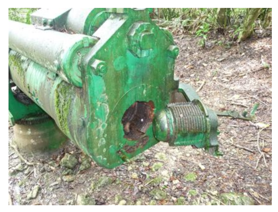
Breech of Vickers gun

Around the loop road, on the opposite side of Nimitz Hill from the Piti Guns is the Pacific War Museum.