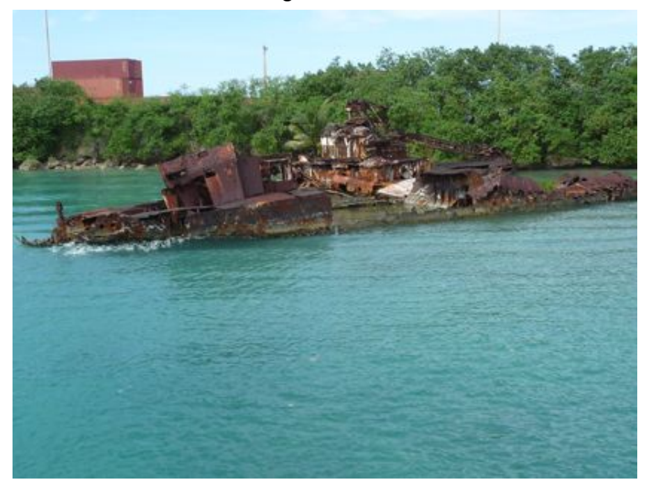
Japanese barge wreckage in Apra harbor