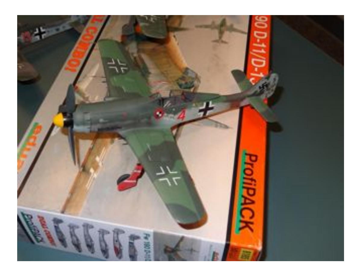
Rick's Eduard 1/48 Fw-190D Dual Combo