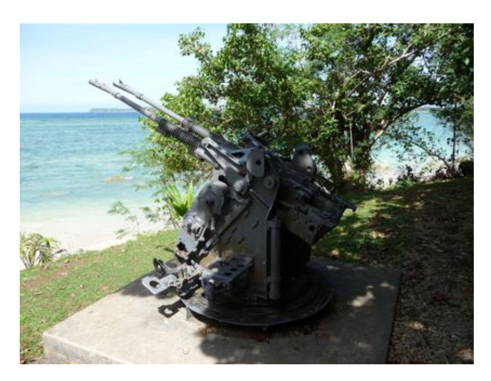
25mm AA gun at Ga'an Site