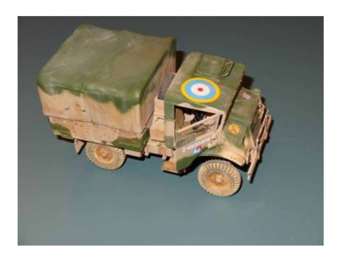
Mike O.'s 1/35 15cwt Chevy Truck