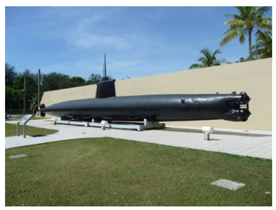
Japanese Ko-hyoteki –class, Type A 2-man midget submarine

The US National Parks Service operates the War in the Pacific National Historical Park on Guam. The park is composed of several important sites throughout the island. The primary visitor center and museum is located just outside the main gate of the Naval Base Guam on the Orote Peninsula. The small museum has numerous displays, some interactive, giving the history of military operations on Guam, the War in the Pacific and the aftermath of the war. Many of the displays focus on the impact to the people of Guam. The museum has an excellent gift shop with may books and videos on Pacific War subjects. On display in front of the museum is a Japanese two-man mini submarine, which ran aground in Apra harbor just a few days after the end of the battle on August 10. This sub was on display for many years on the Navy base, but was recently moved to the visitor center.