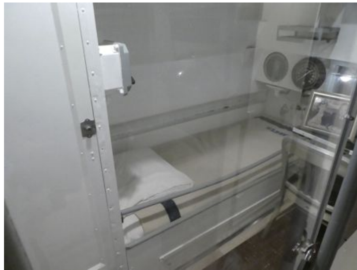
Most luxurious place in the sub – the Captain's quarters. The inside of the sub is painted white to make it seem less claustrophobic.