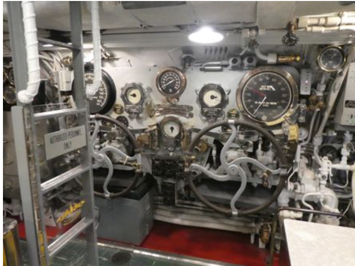
Helm in the main control room. Large wheels control the forward and aft dive planes, and the large gauges are depth gauges. There is a separate rudder control station aft of this, which also has the engine room telegraph.