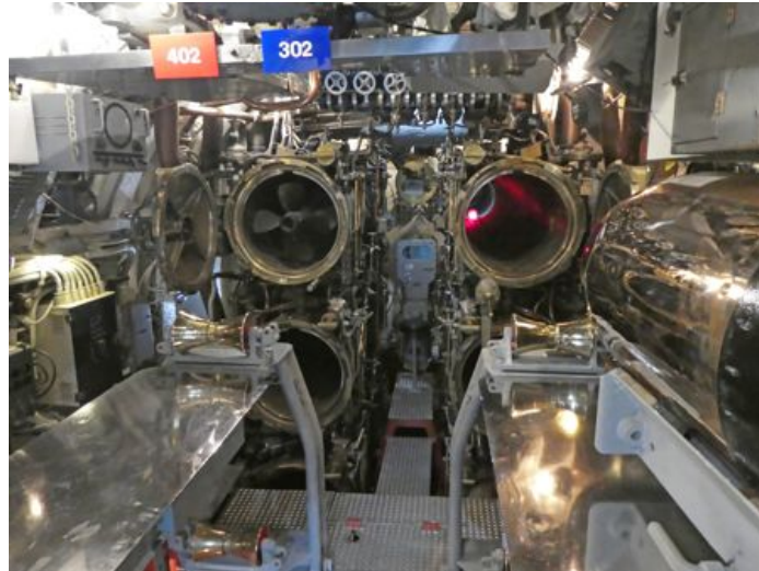
Forward torpedo room, containing 4 torpedo tubes. Note the upper left tube is loaded and the torpedo on the right. Every inch of space is utilized in the sub, and there are crew bunks above the torpedoes.