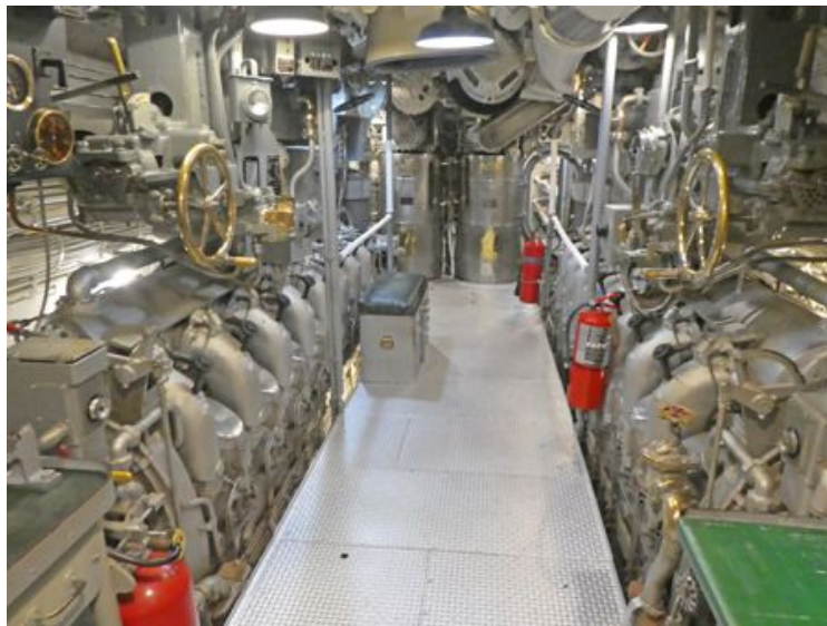
Forward engine room. Engines are General Motors 16-248 V-16 2-stroke diesels, driving electric generators. Bowfin has 4 engines.