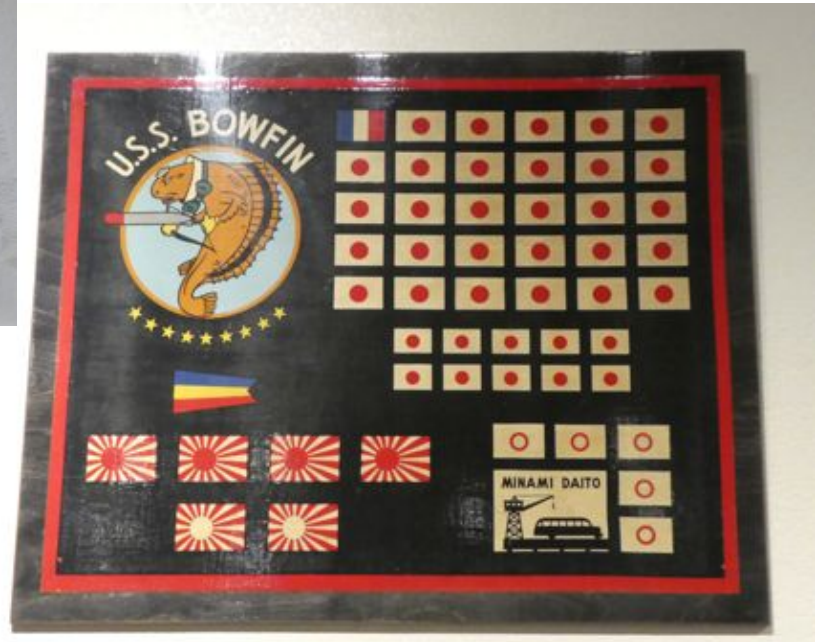
Plaque representing Bowfin's last battle flag