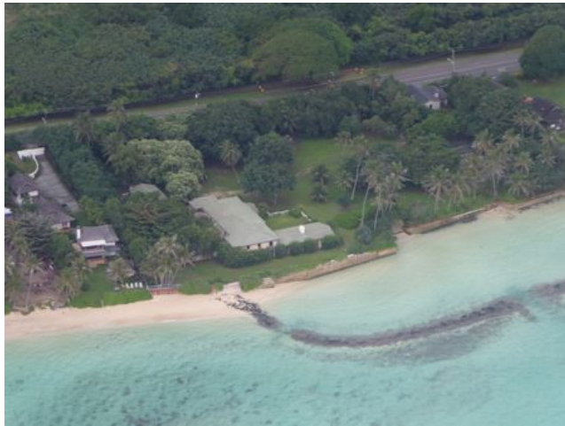
‘Robin’s Nest’ from Magnum PI . Located on the east side of the island. This estate recently sold for $10M.