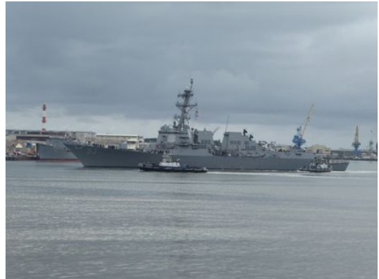
Guided Missile Destroyer DDG-93 Chung Hoon

There is an incredible amount to see at Pearl Harbor, so I recommend planning an entire day.