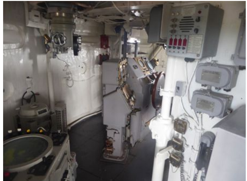
Missouri Armored Bridge

Down the road a bit is the Pacific Aviation Museum, which recently moved from its previous location at Honolulu Airport. The museum is a bit of a work-in-progress, consisting mostly of an outside display of aircraft that operated in Hawaii, although there are a few surprises, such as a very nice ROK F-5A and an Australian F-111G. There is a very nice indoor display of Pearl Harbor related aircraft, including wreckage of an A6M2 from the raid and a depiction of a Doolittle Raid B-25B. The museum is refreshingly honest about the displays, pointing out that although the P-40 is in the markings of George Wheeler, it is a P-40E and not the correct P-40B, and that the B-25B was constructed and converted from several wrecked B-25J's. But the real surprise, and gem of the museum is the "Swamp Ghost". Located in the restoration hangar, the "Swamp Ghost" is a B-17E that was forced down in a New Geneva swamp early in the war, where it remained for over 60 years until it was recently recovered. The museum intends to restore the aircraft for display.