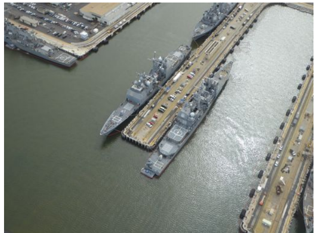
DDGs and CGs in port