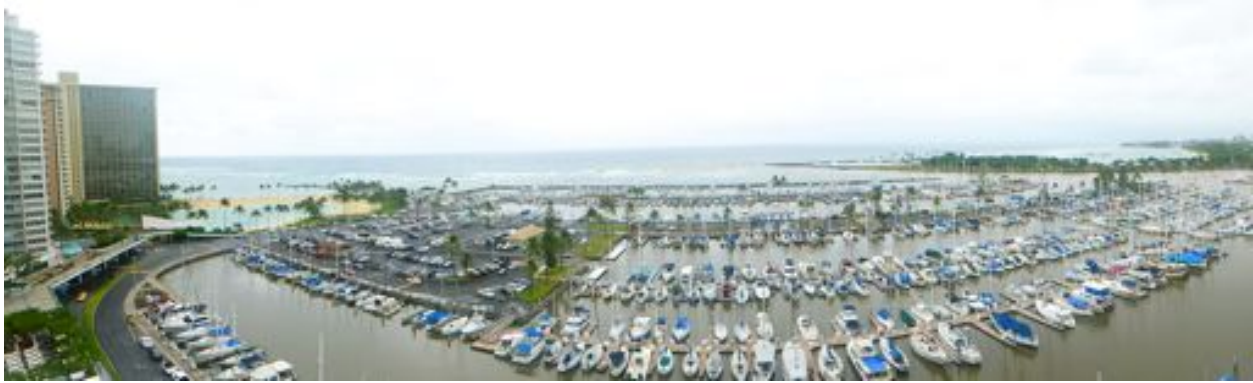
Ali Wai Yacht Harbor, Waikiki. This is where the S.S. Minnow set out from for a ‘three hour tour’ on Gilligan’s Island ”. Although most of Gilligan’s Island ” was filmed in a parking lot in Burbank, the actual island that appears in some shots in the show is on the opposite side of Oahu from Honolulu. The building farthest to the left in the photo is the Ilikai Hotel, which you see Jack Lord standing on the roof of during the opening credits of the original Hawaii Five-0 . There is also the same shot of Alex O’Loughlin in the new Five-0 reboot.

Finally, if your of a ‘certain age’, or are a retro-TV junkie, you’ll recognize a lot of spots on Oahu that have appeared on TV. Going back to “Hawaiian Eye”, portions of “Gilligan’s Island”, the original “Hawaii Five-0”, “Magnum PI” to “Lost” and the re-boot of “Hawaii Five-0”, many TV shows (and movies) have been filmed on the island.