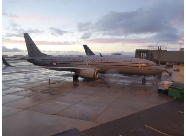
Alaska 'retro-jet' '40's scheme 737