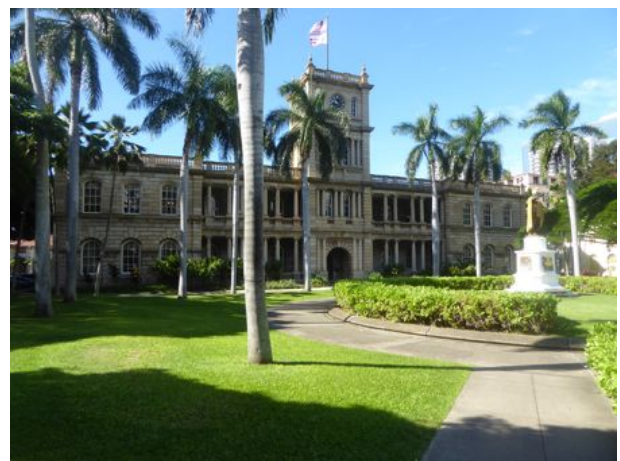
Hawaii Justice Museum and King Kamehameha statue. This is supposedly the Five-0 Head-in the new series. It is right across the street from Iolani Palace.