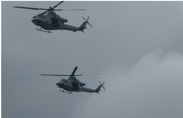
UH-1Y's in flight

Pearl Harbor is still a major operational Navy base, so there is an opportunity to see current naval hardware in operation.