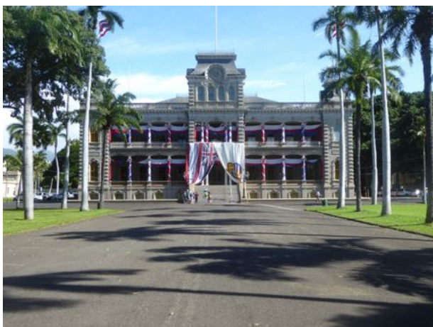
Iolani Palace, home to the last King and Queen of Hawaii, but also Five-0 Headquarters in the original series.