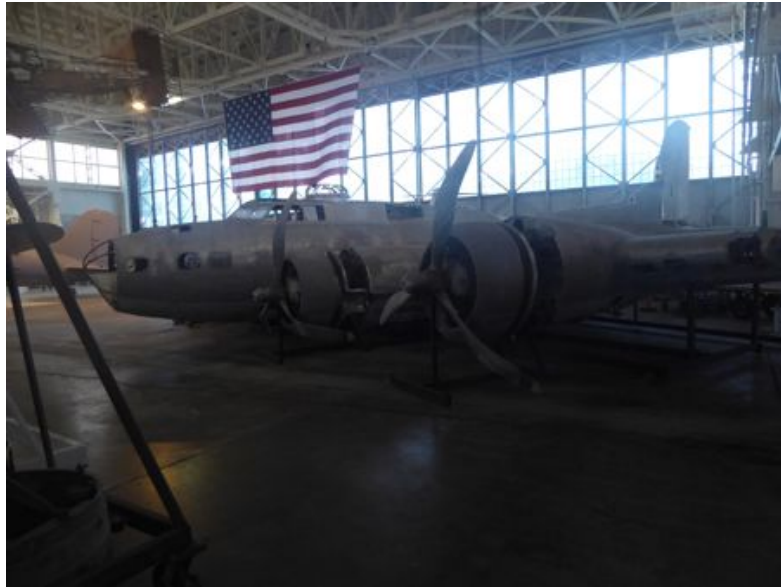
B-17E "Swamp Ghost"

Pearl Harbor is still a major operational Navy base, so there is an opportunity to see current naval hardware in operation.