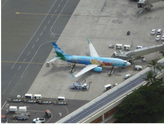
Alaska "Islands" 737

If you're an airliner modeler, Honolulu Airport offers some unique observation opportunities. Due to the mild climate, the passages from the main ticketing areas to the gates are open-air, which is very rare. Plus, there seem to be more unusually marked aircraft in attendance.