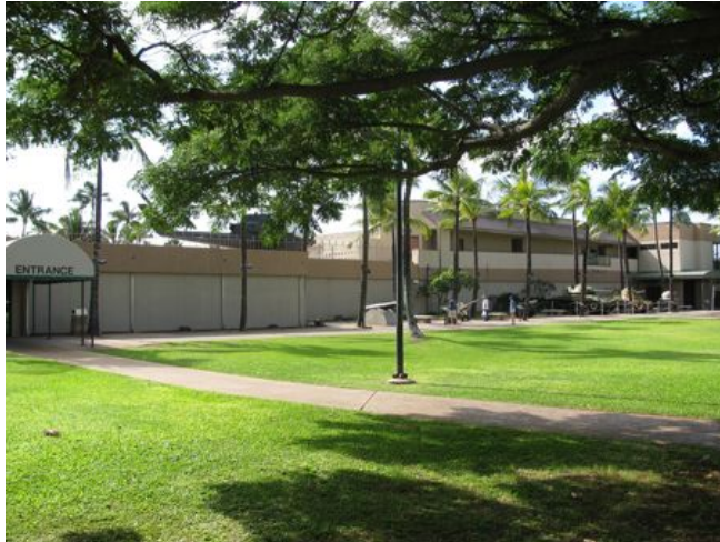
Army Museum of Hawaii

Although it seems a very “touristy” thing to do, I highly recommend booking a helicopter tour of Oahu. There are some very polished, slick tour operators, but I flew with a small, family-run operator from North Shore that operates an authorized replica of the “Magnum P.I.” Hughes 500D, right down to the N-number. The helo is even signed by the actors that played T.C. and Rick. The MD500 is the Ferrari of helicopters, and this operator (Paradise Helicopters) conducts door-off flights. Our pilot took us on the course that the Japanese took on the PH attack, and you get views of PH (such as the ‘boneyard’ and sub pens) that you cannot see any other way. Well worth the cost!